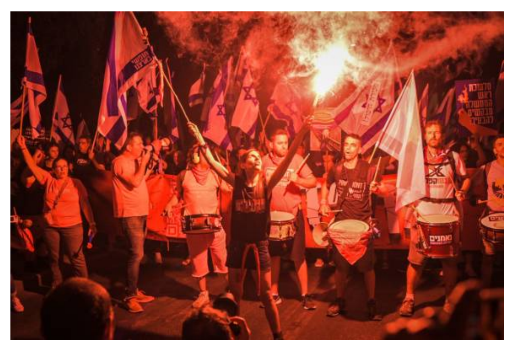
Protests in Israel over Benjamin Netanyahu's reforms