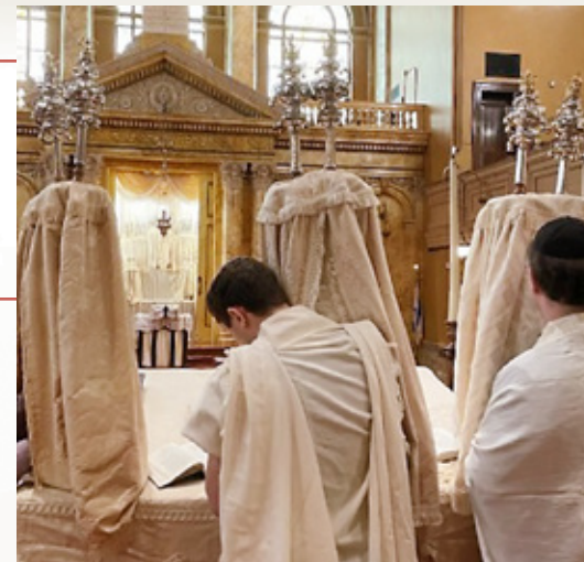
The three pairs of Myer Myers rimonim in ceremonial usage on Hoshana Rabba

As a community, Shearith Israel has its own little piece of American history to safeguard. I refer to the fact that we are blessed with many sets of Torah finials that sit on top of the wooden handles of our Sifrei Torah. In Hebrew, the finials are called rimonim . In plain English, they are often just called bells, because of the small bells that actually adorn the finials. The bells chime and clang when the finials are doing their job accompanying the Torah scrolls to and from the hekhal (or ark) that houses scroll and bells together.