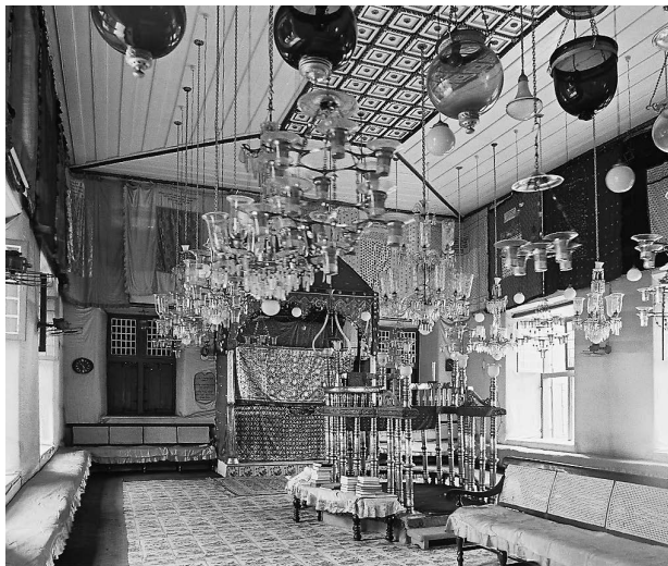
The Paradesi Synagogue of Cochin, India

The Cochin Jews include South Indian spices and flavors such as coriander, turmeric, coconut, and chilies in their cuisine. The daily diet consists of fish and vegetable and rice flour dishes. Chicken is generally served only for Shabbat. This Shabbat hamim, traditionally slow-cooked in a brick oven, is prepared for Shabbat afternoon or festivals.