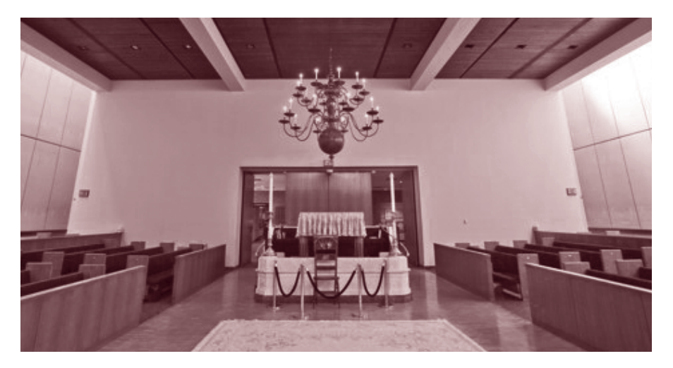
The Main Sanctuary of Mikveh Israel, Philadelphia

n Judaism, family is ever important. And so it is nice to know that at Shearith Israel we are not only part of the greater Jewish family, but also a small but special global family of Spanish & Portuguese congregations - from our "mother" congregation in Amsterdam to London, Jerusalem and others where our uniquely beautiful minhag can be heard.